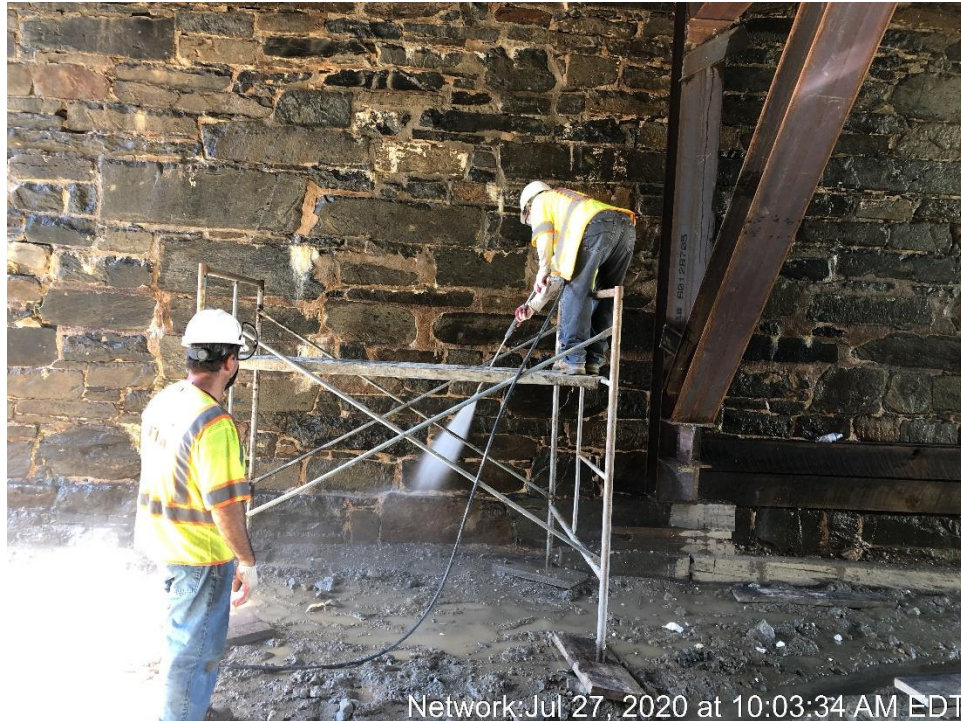
Network: Jul 27, 2020 at 10:03:34 AM EDT Canal Wall Stone Cleaning and Repointing