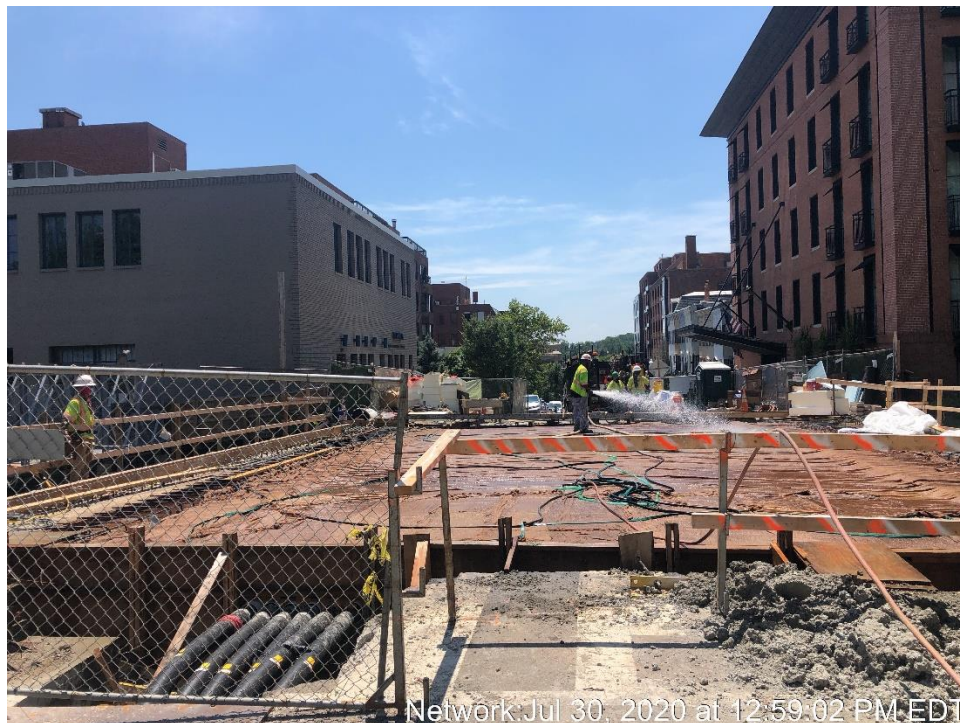
Bridge Deck – Concrete Curing