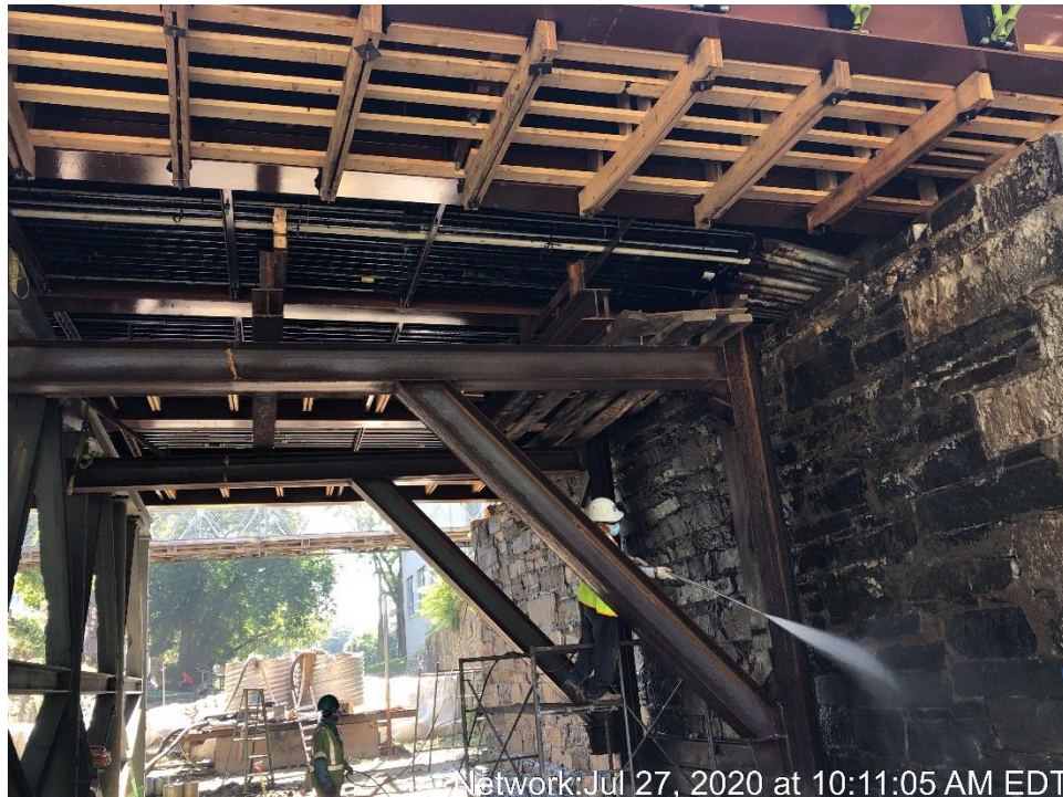
Network: Jul 27, 2020 at 10:11:05 AM EDT Canal Wall Stones Cleaning and Repointing