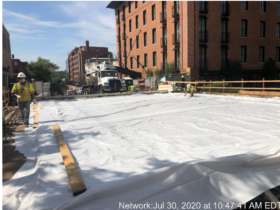
Network: Jul 30, 2020 at 10:47:41 AM EDT Bridge Deck – Concrete Curing