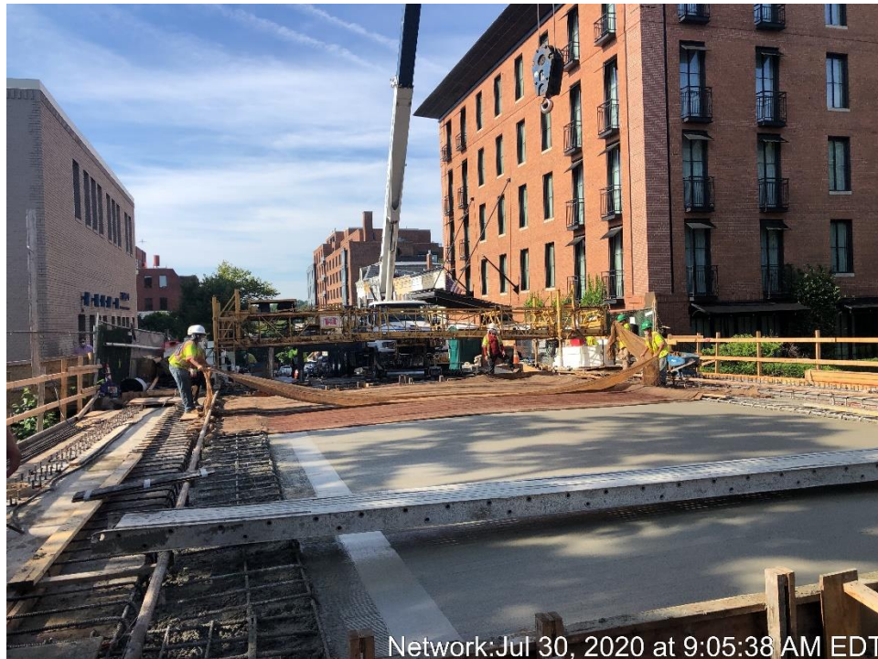
Bridge Deck – Concrete Curing