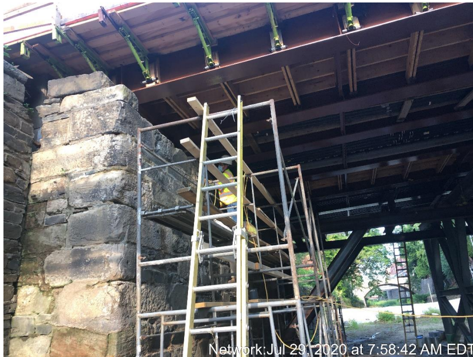
Network: Jul 29, 2020 at 7:58:42 AM EDT Canal Wall Stone Repointing