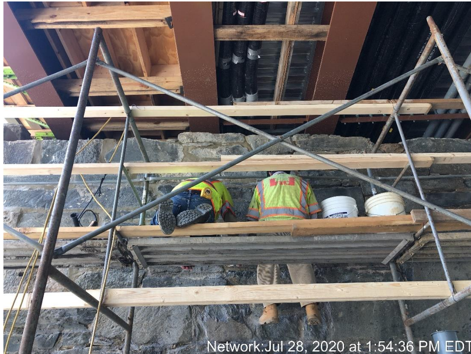
Network: Jul 28, 2020 at 1:54:36 PM EDT Canal Wall Stone Repointing