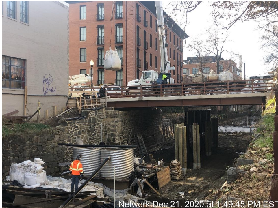
Removal of the Downstream Cofferdam