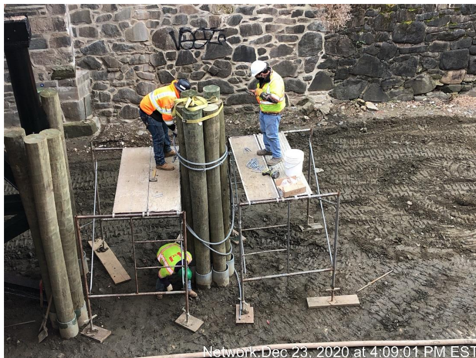
Installation of Wire Rope Around the Dolphins