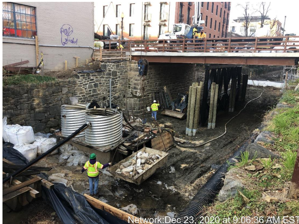
Removal of the Downstream Cofferdam