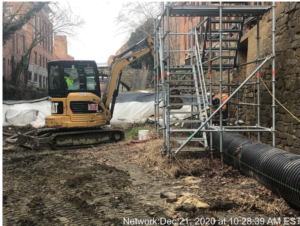
Site Cleaning and Grading