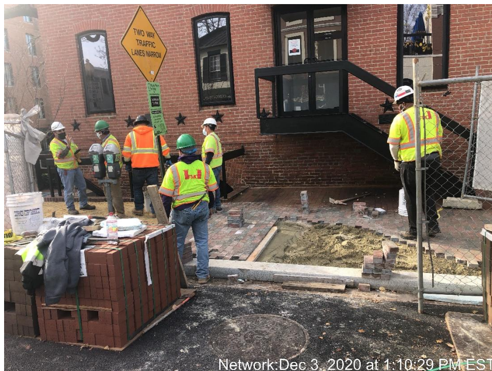
Brick Sidewalk – West Side of the Bridge