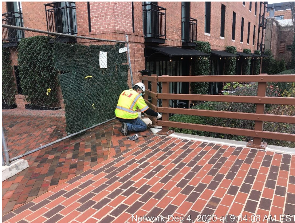
Application of Sealant – SW Section of the Bridge