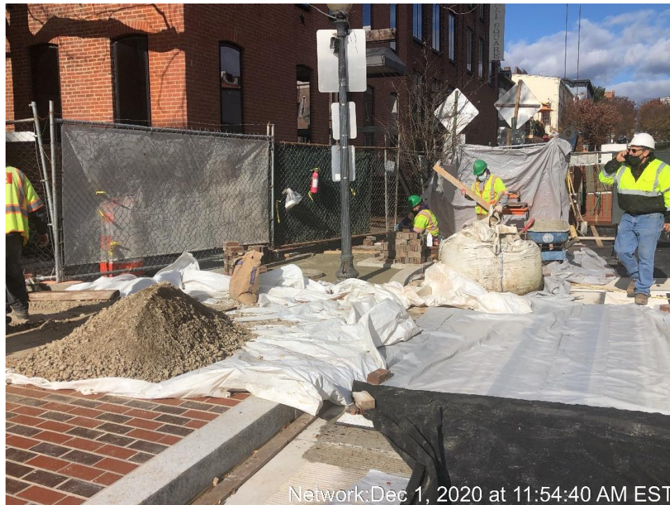
Construction of Brick Sidewalk – North West Side of the Bridge