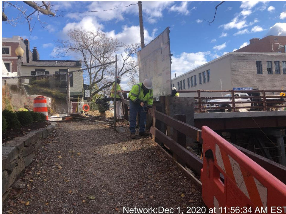
Network: Dec 1, 2020 at 11:56:34 AM EST NPS Railing Along Towpath – NW Side of the Bridge