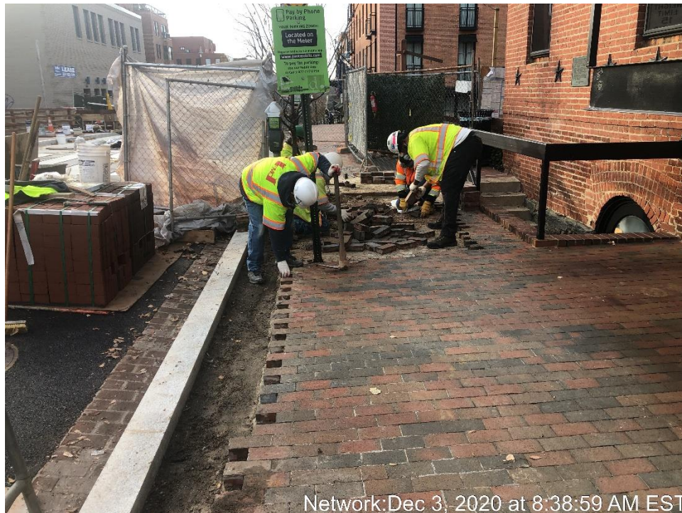
Network: Dec 3, 2020 at 8:38:59 AM EST Construction of Brick Sidewalk – NW Side of the Bridge