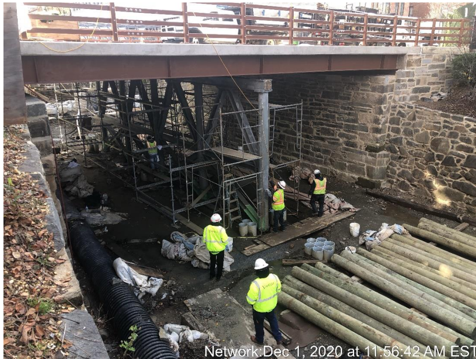
Network: Dec 1, 2020 at 11:56:42 AM EST Painting Operations at the Historic Pier