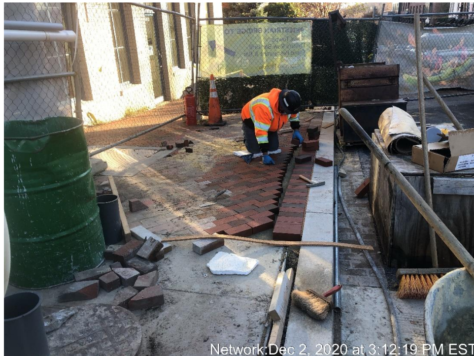
Construction of Brick Sidewalk – NW Side of the Bridge