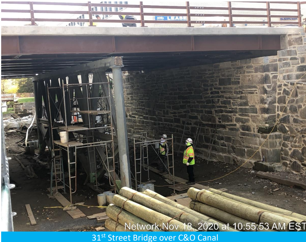
31 ST Street Bridge over C&O Canal

Project Website: www.31stStreetBridge.com