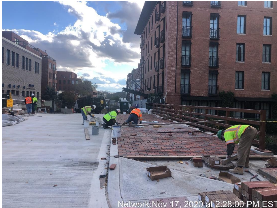
Construction of Brick Sidewalk – West Side of the Bridge