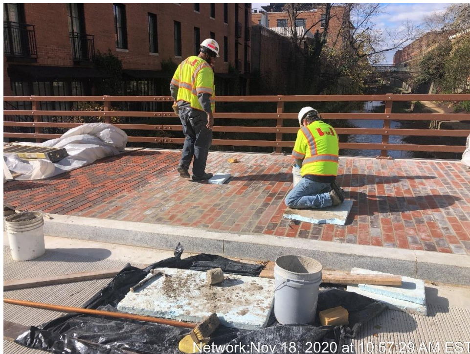
Construction of Brick Sidewalk – West Side of the Bridge