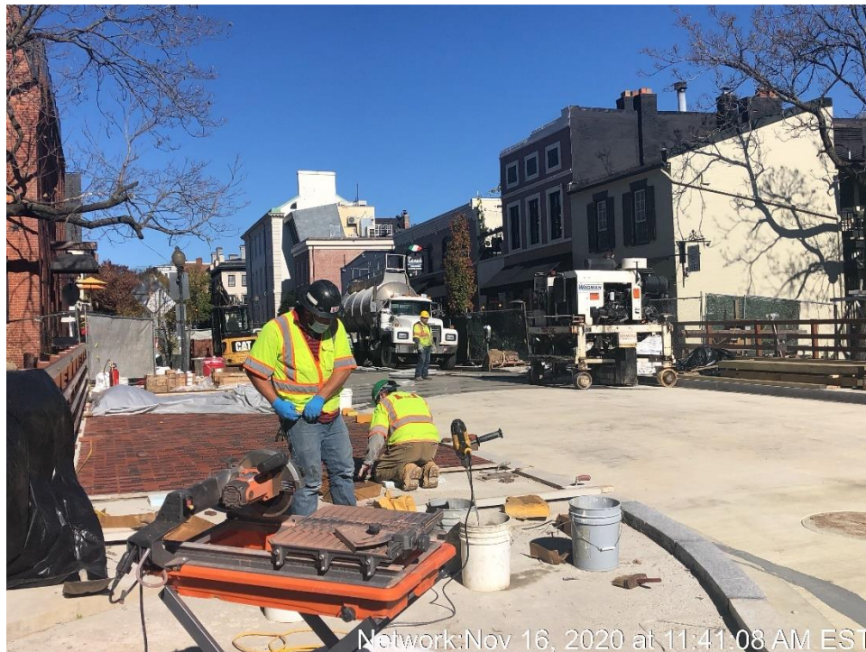
Grooving at the North Approach Slab

Network: Nov 16, 2020 at 11:41:08 AM EST