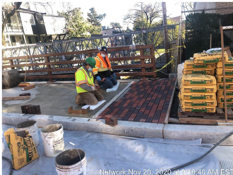
Network: Nov 20, 2020 at 9:40:40 AM EST Construction of Brick Sidewalk – East Side of the Bridge