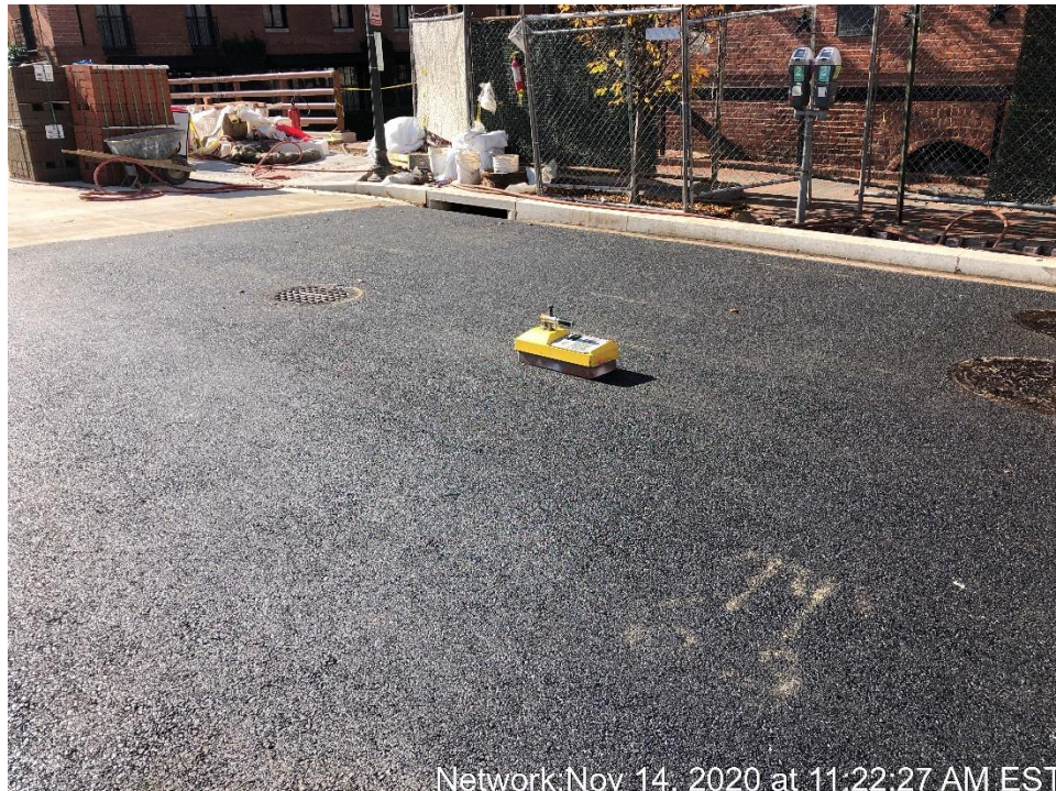
Placement of Asphalt at South Side of the Bridge

Network: Nov 14, 2020 at 11:22:27 AM EST