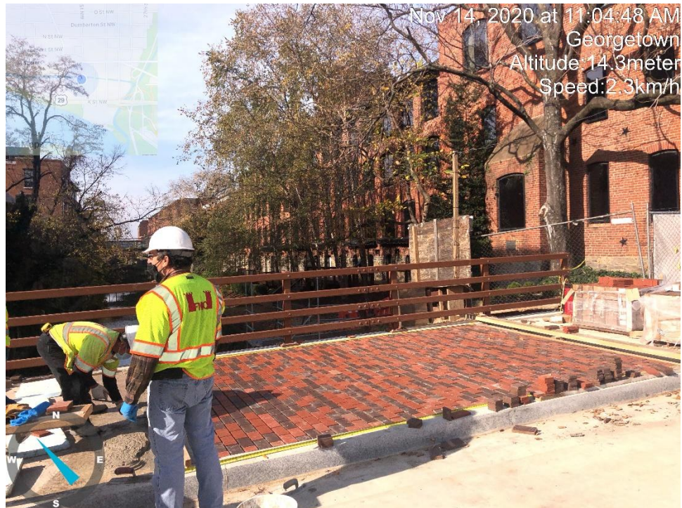
Construction of Brick Sidewalk – West Side of the Bridge

Nov 14, 2020 at 11:04:48 AM Georgetown Altitude: 14.3 meter Speed: 2.3 km/h