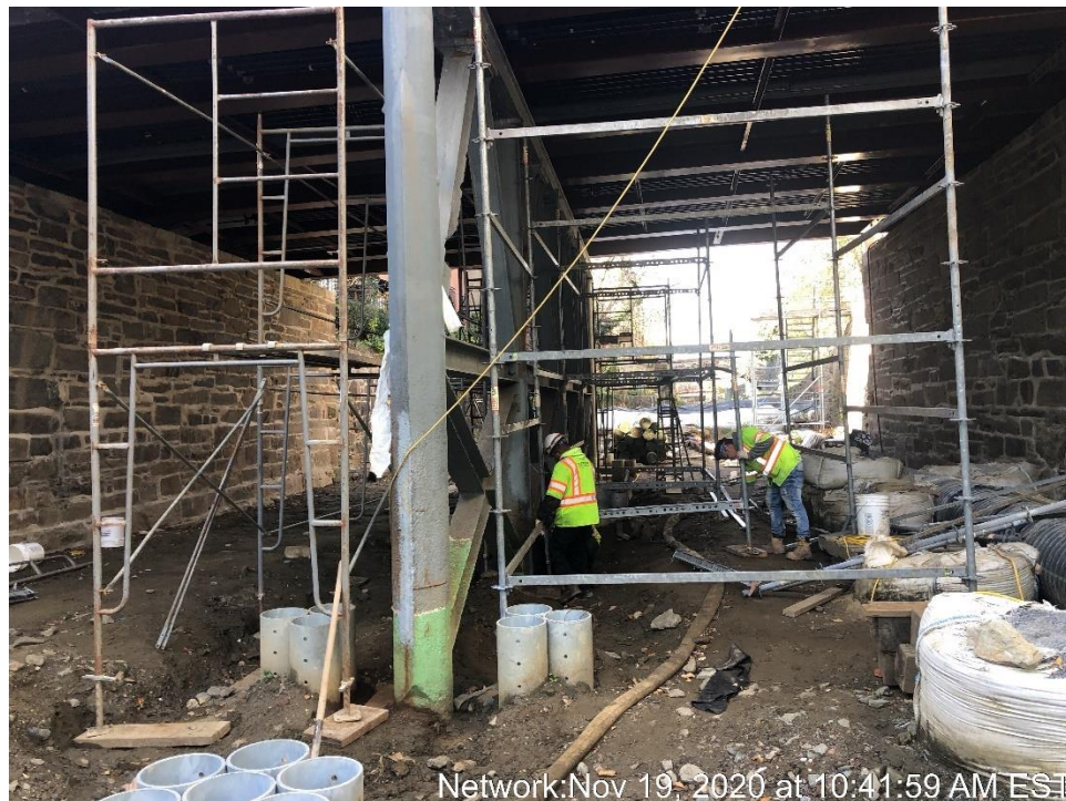
Network: Nov 19, 2020 at 10:41:59 AM EST Scaffolding and Containment for Pier Epoxy Hole Filling